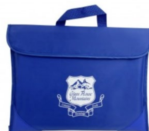
BAG LIBRARY OS

Parents may apply to become borrowers and have a two week borrowing period with a maximum of two items.